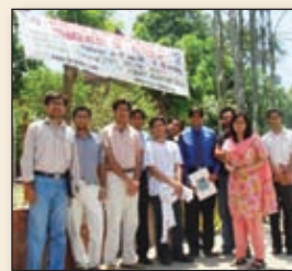
Asthma Workshop organized by SPWS in the KEMU Auditorium

After the launch of Asthma(Inhalers) section we organized an Asthma workshop in Mayo/KEMU to promote the awareness regarding Inhalers in junior doctors and medical students.