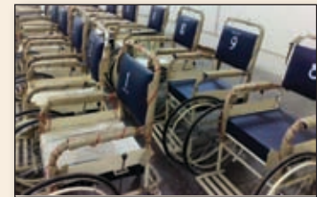
New wheel chairs donated by SPWS