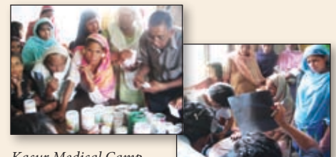
Kasur Medical Camp