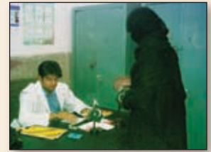
The SPWS office, Room 19A OPD, is always helping poor patients

he still comes to SPWS dispensary every month to get his inhalers. The monthly budget of Anti-Asthma Inhalers section is 500-600 $, if we can find 5-6 members from KEMCAANA who can donate 100 $ per month then probably many poor children like him can continue to receive their inhalers for the whole life.