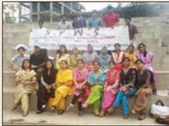
The Pink Ribbon Campaign organizers

In the summer, there was a Pink Ribbon Campaign launched by SPWS which was a Breast Cancer Awareness Program in which more than 150 SPWS female members participated and went to all the medical wards of Mayo and Lady Aitchson and educated more than 500 female patients regarding breast lump and breast cancer. Ironically 17 of them had a breast lump which they came to know after this awareness campaign and SPWS paid for their mammograms and FNAC; 2 of them were diagnosed of breast cancer and they were unaware of it.