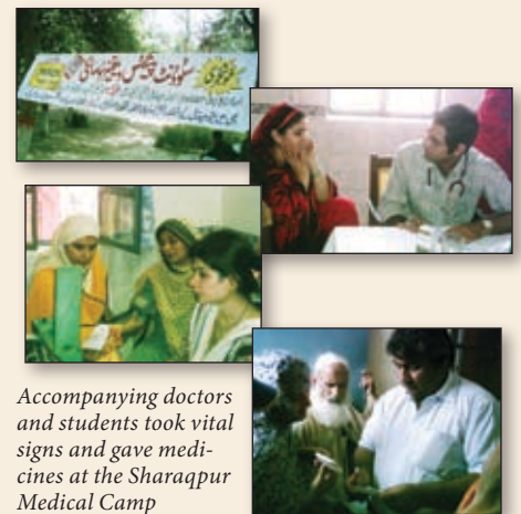
Accompanying doctors and students took vital signs and gave medicines at the Sharaqpur Medical Camp

The next two medical camps in Sharaqpur and Kasur were even bigger success with more than 700 patients, provided with free medical checkups by the volunteer doctors of Mayo and free medicines by SPWS. Then there was a first aid training for the SPWS members in order to improve their performance in these medical camps.