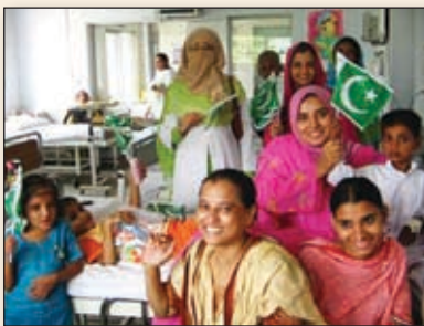
SPWS members with children in Paeds Ward on Independence Day

In August 2007, we collected funds for flood Victims of Balochistan and provided them with all the much required goods. Then in order to bring smile on the faces of children in Mayo Paeds dept, Oncology dept, Medicine dept and Emergency, making sure they don't feel ignored on this day of celebration, we organized an Independence Day Celebration for them in which we gave them gifts, sang songs, shared jokes, played games with them and distributed refreshments.