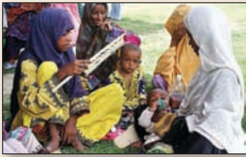
Flood victims of Balochistan helped by SPWS

In August 2007, we collected funds for flood Victims of Balochistan and provided them with all the much required goods. Then in order to bring smile on the faces of children in Mayo Paeds dept, Oncology dept, Medicine dept and Emergency, making sure they don't feel ignored on this day of celebration, we organized an Independence Day Celebration for them in which we gave them gifts, sang songs, shared jokes, played games with them and distributed refreshments.