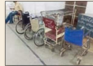
Total number and condition of wheel chairs and stretchers previously in the Mayo OPD

a single penny has been taken from Govt. for it. This is the only main functional 4- bedded Medical ICU of Mayo Hospital. In recognition of its efforts, Prof. Javed Akram awarded a shield to SPWS and its active members to acknowledge them for their hard work in collecting funds for ICU WMW.