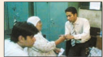
Blood samples were taken to measure BSR at the Mayo Diabetic Camp.

Then there were signboards with directions installed in the whole OPD for the patients’ convenience. Many more signboards need to be installed in Mayo and KEMCAANA can help SPWS in this regard with its donations. After that we held four medical camps in a row; first two were in Mayo Hospital, one was Asthma camp and the other was Diabetic camp in which more than 200 patients were not only provided with free check-up but also free lab tests and free medicines.