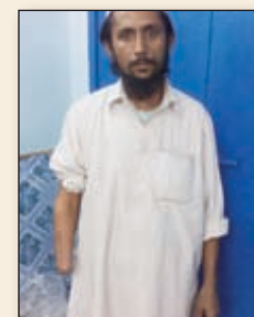
Before artificial arm

There were also few poor university servants helped by SPWS. One of them was the carpenter whose arm was crushed under the roof of his house that fell down, KEMCAANA collected Rs. 90,000 for his surgery, treatment and the repair of his house. There was a poor hospital servant whose father died and he was in a financial crisis, he could not afford to arrange the funeral; KEMCAANA collected Rs. 25,000 to help that poor man in the difficult time. There was a hostel servant who lost his arm 12 years back while cutting sugar-cane and was without arm since then, we got him an artificial arm and paid for all the expenses, thus playing a part in his rehabilitation.